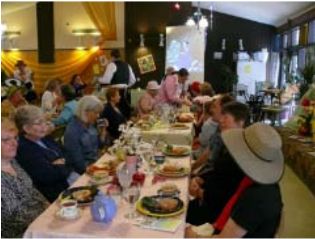
Spring Tea, May 22 "Taking Tea with Alice"