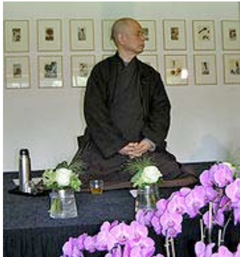
Thich Nhat Hanh in Vught, The Netherlands, 2006