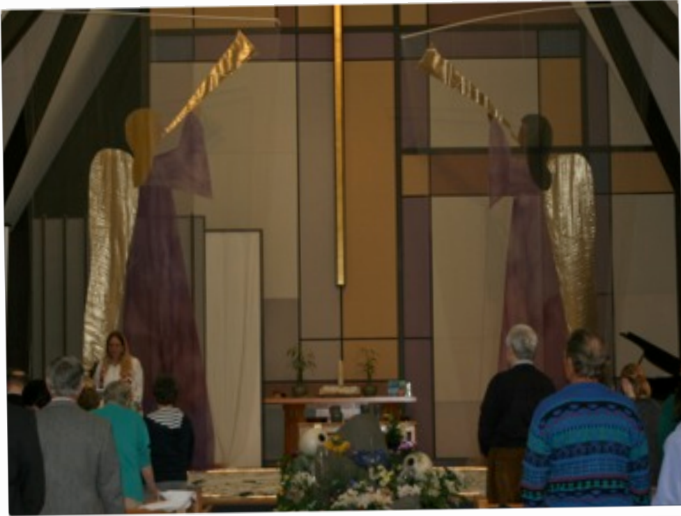
April 4, 2010 Easter 10:30 am Worship