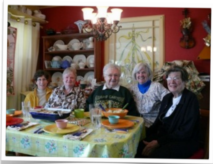
March 29, 2010 Sisterhood of the Needle and Thread prepares for Spring Tea