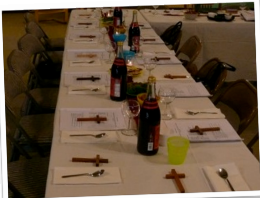
April 1, 2010 Maundy Thursday Seder and Tenebrae