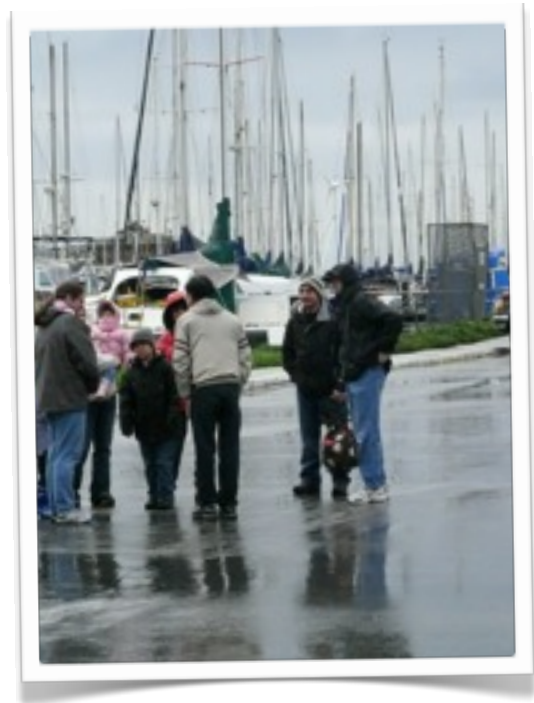
February 27, 2010 Church Whale Watch