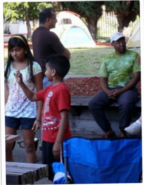
September 12, 2009 Church Camp Out and return of the drum Choir