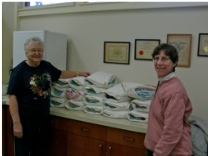
February 22, 2010 24 Baby Kits sent to CWS for Haitian earthquake survivors