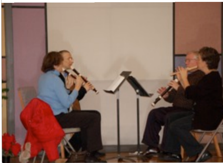
December 13, 2009 The Recorder Choir's first time in worship