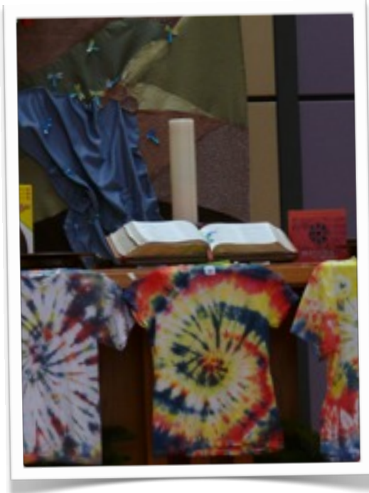
August 2009 begin prayer series. 8/11/09 spirals