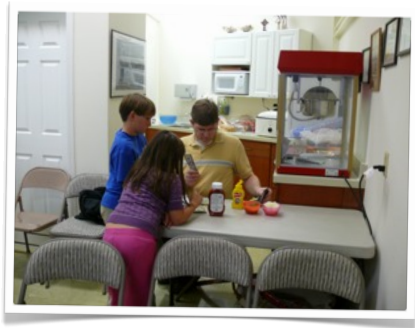
November 13, 2009 Sunday School hosts Movie Night raising money for Heifer Project