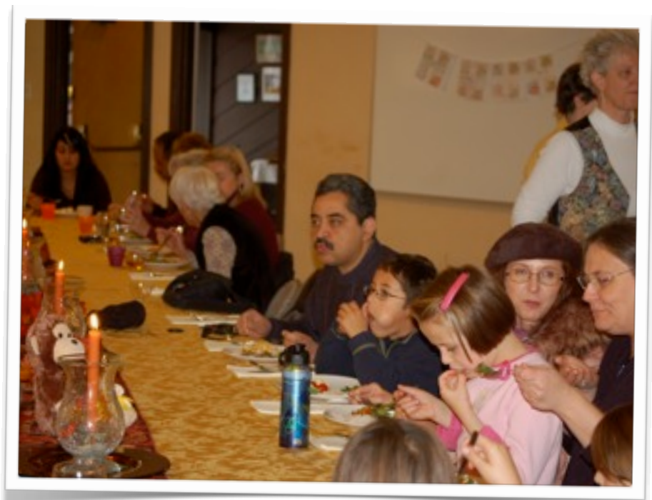
November 20, 2009 Thanksgiving Sunday