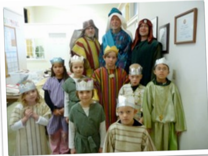
January 3, 2010 Epiphany Sunday, Kings Arrive Baby items collected for FISH