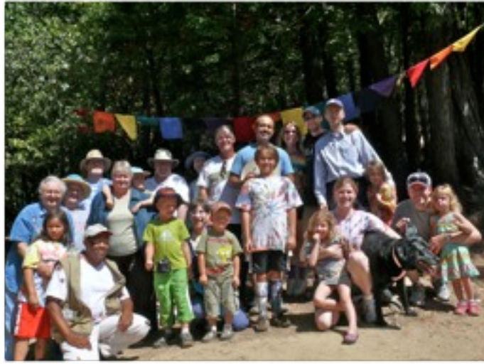
September 7, 2009 All Church Fishing Day