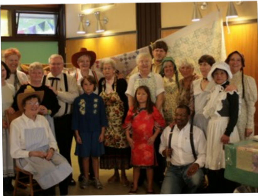
October 18, 2009 Fall Festival of Pioneers