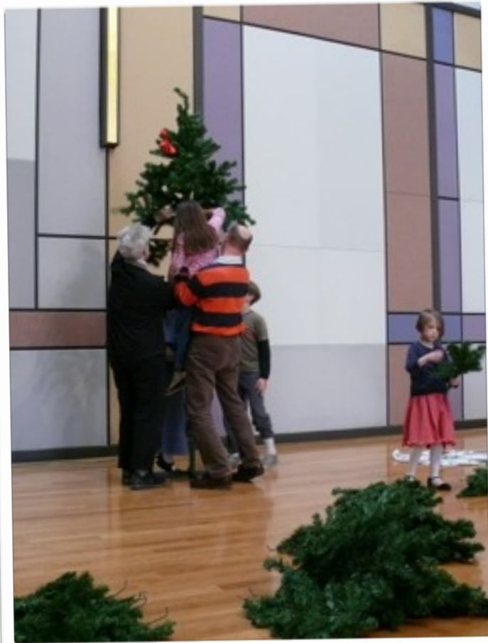
November 29, 2009 Decorating for Advent