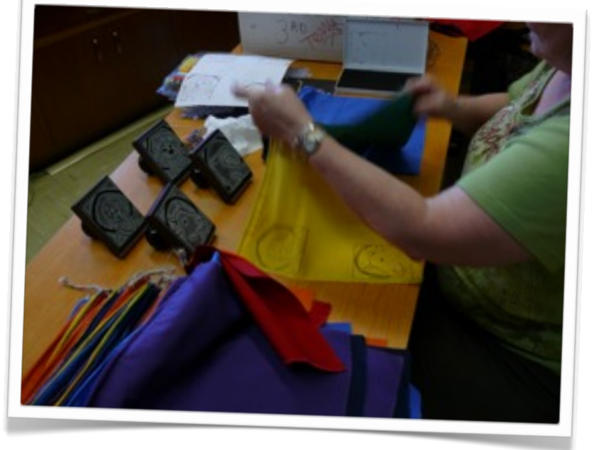
August 13, 2009 prayer flags stamped with the 4 gospels