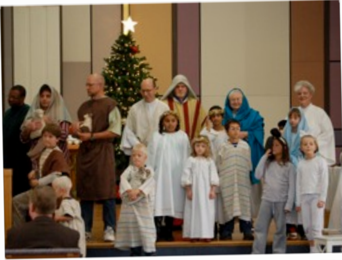
December 13, 2009 Children's play from the Gospel of Luke