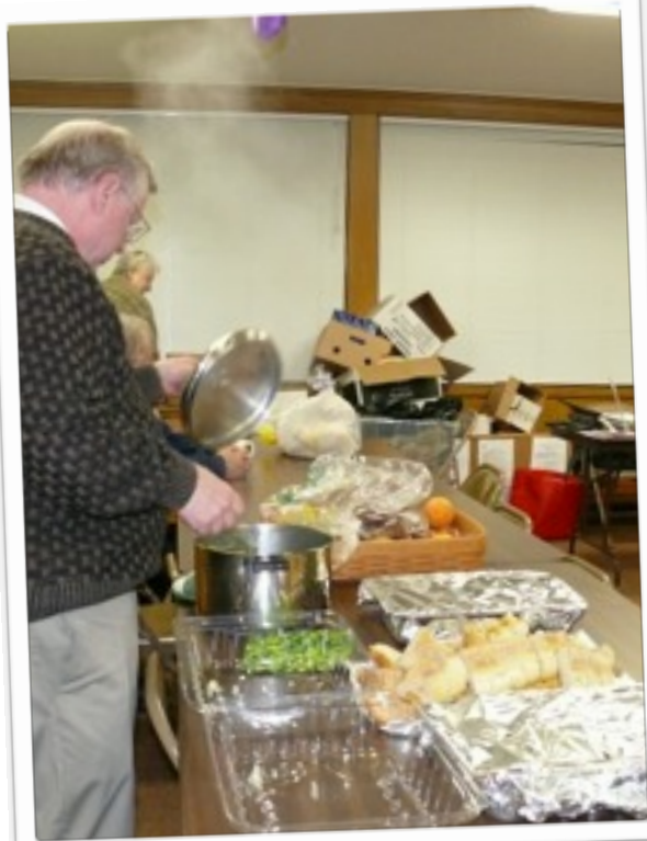
Dec 5, 2009 - Jan 2, 2010 Rotating Shelter is with us