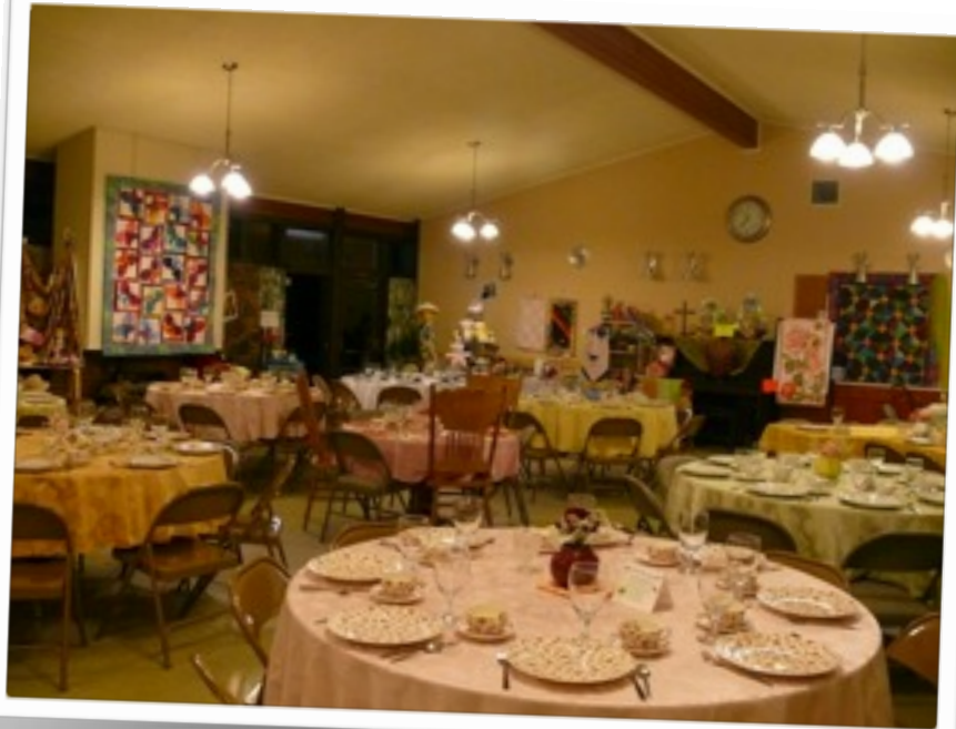
April 25, 2010 Spring Tea