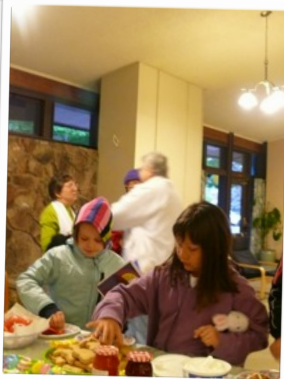
April 4, 2010 Easter Sunrise