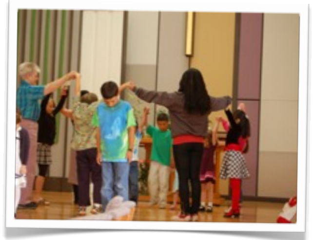
June 14, Sunday School presents play about inclusion