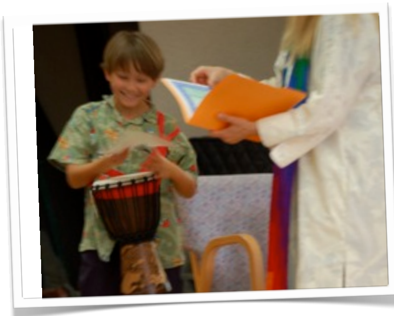
June 14, 2009 Drum Choir receives awards